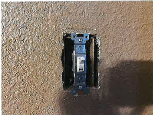
3804-1 Drywall/Joint Compound Typical Interior Walls/Ceilings