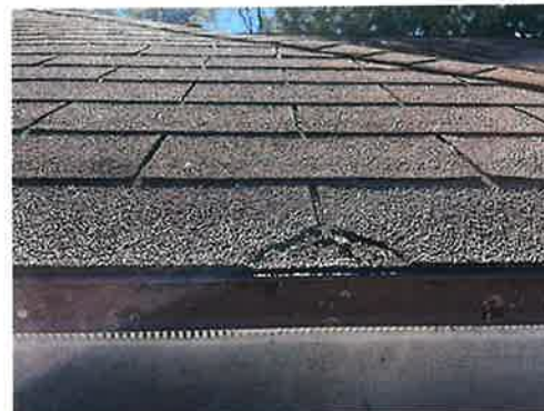
3804-4 Asphalt Shingle Typical Exterior Roof