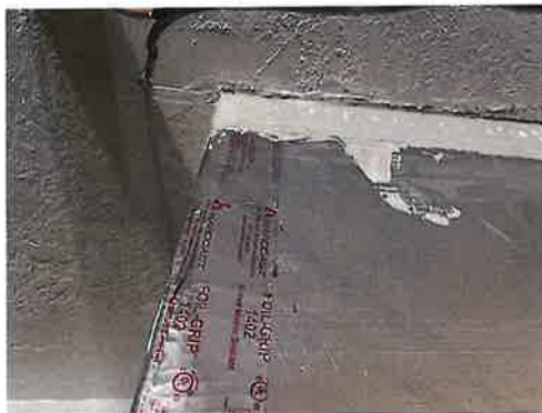
3804-3 Duct Mastic Typical Interior HVAC