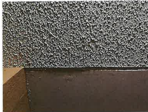
3804-2 Popcorn Texture Typical Interior Ceilings